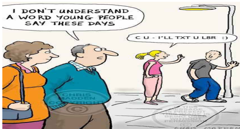
(Image 1: Image Showing the Parents getting confused with the short message use by kids)

Abbreviations like haha, lol, omg, brb, and btw are more infrequent than you imagine, the use of short forms, abbreviations, and emotional language is infinitesimally small. These shorts of stereotypical markers of teen language could be one of her most interesting findings is that older teens start to outgrow the abbreviation lol, opting for the more mature. If we always put our cell phones in our pockets we can receive that message, then you have the conditions that allow that we can write like we can speak, and that where texting comes soon in. And so texting is very loose in its structure. No one thinks about capital letters and punctuations when one texts.