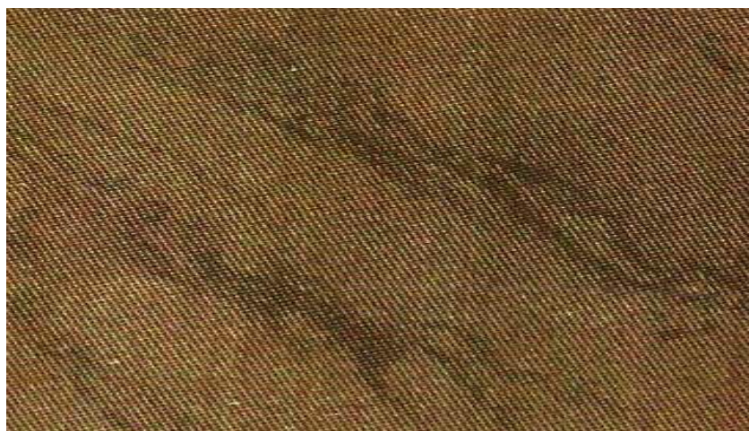
Plate 2-Current rippled sandstone

Current-rippled sandstone. The lithofacies consists of fine to medium grain sandstones with some coarse grain materials found at the base. It is moderately sorted. There are no wavy beds and has a clay content but low angle crossbeds exist. The rippled sandstone is draped by wavy, dark grey mudstone which is asymmetrical with a gentle slope, an indication of current direction. The lithofacies contains a sporadic bioturbation traces though traces of Planolites and ichnofacies is common with scanty Skolithos traces. This type of lithofacies is likely to occur in fluvial or shallow marine environment. Hence, tidal channel or tidal flat are the likely potential origin of this facies.