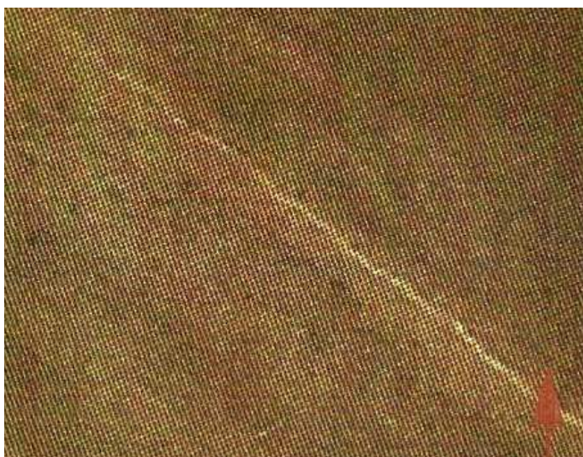
Plate 1- Planar laminated sandstone

Planar laminated sandstone. The lithofacies, planar laminated sandstone comprises fine to medium sand particles. It is moderately to well sorted, grey in colour and consists of planar grain lineation of coarse and medium grains which form laminae on foresets (Plate 1). The lithofacies is about 2cm to 4cm thick, it has an erosional relationship with overlying lithofacies coarse grained cross bedded sandstone and gradational relationship with underlying lithofacies wave rippled sandstone. However, very fine grains of mud are conspicuously absent and there is no presence of bioturbation activities in this lithofacies. In essence, it is an indication of high energy or shallow marine environments