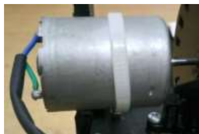
Figure 1. Specification of Motr BLDC

The BLDC motor does not use brushes for commutation and has a synchronous speed between the rotating field of the stator and the rotor. The BLDC motor rotor is a permanent magnet, so there is no need for an amplifier coil and no load current flows it. There are two kinds of BLDC motor speed control methods, namely, supply voltage settings and phase advance angle. In setting the phase angle acceleration, optimal speed can be obtained when current and emf together in time or other words phase [3].