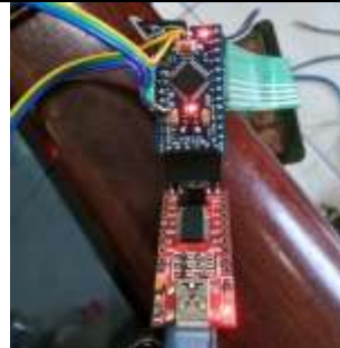
Figure 4. Testing of Wire

The picture above is testing the microcontroller, which is by turning off the LED's life on the microcontroller every second. The picture above explains that the test when the microcontroller LED lights up.