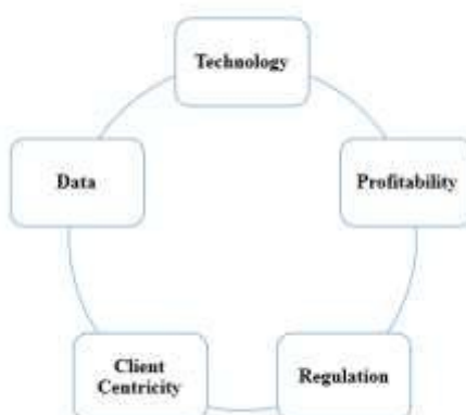
Fig 2: Component of Influencing Trends in Investment Banking