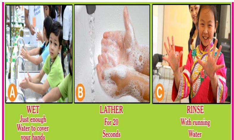
Figure 2. How to wash hand and maintained hygiene